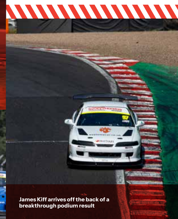
James Kiff arrives off the back of a breakthrough podium result