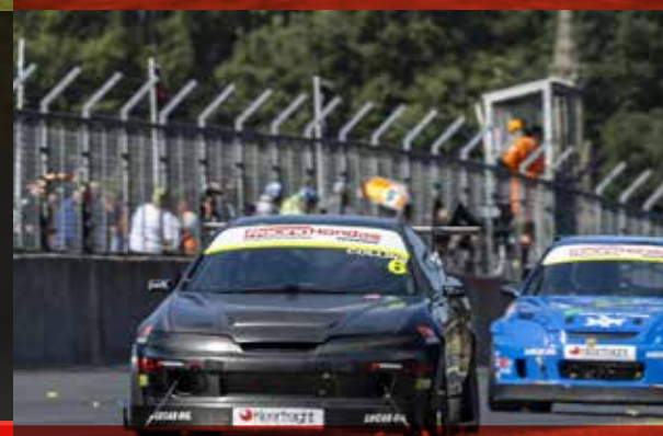
Liam Collins & Tommy Knight are both potential race winners